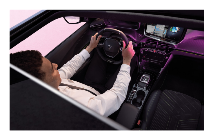
Opening Panoramic Sunroof with Interior Blind Optional Upgrade $2,990