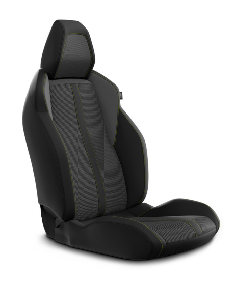
'Belomka' Seat Trim Standard