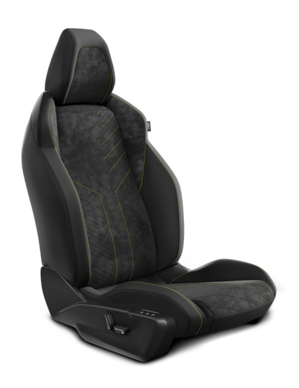
'Alcantara' Seat Trim Optional Upgrade $2,990