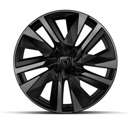
18" 'EVISSA' Alloy Wheels (ZHKP) Diamond Cut Black Mist