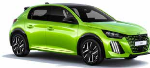
Agueda Yellow (M0EQ) metallic $0