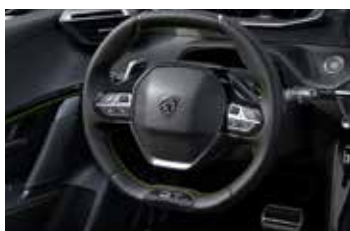
Compact multi-function steering wheel

The PEUGEOT i-Cockpit® philosophy centres around a driving environment that puts you in control, allowing a greater connection to the road. For PEUGEOT 208, the PEUGEOT i-Cockpit® brings driving resolutely into a new age. The PEUGEOT i-Cockpit®, comprises of the following key features: