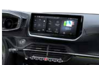
10" HD Capacitive Touchscreen