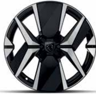
17" 'YANAKA' Alloy Wheels (ZHK5) Two-tone Diamond Cut Gloss Black Inserts