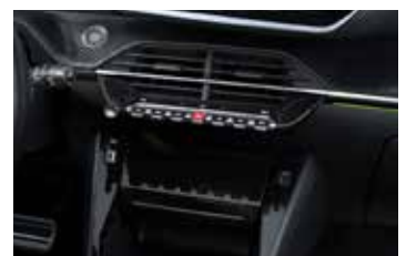
Piano Key Toggle Switches