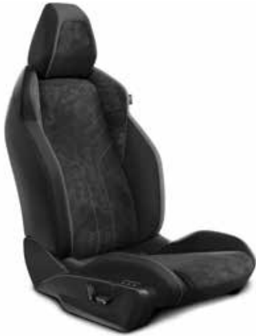
Alcantara Seat Trim Standard