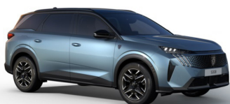
Ingaro Blue metallic $0