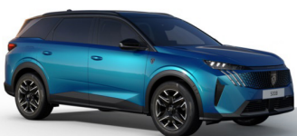
Obsession Blue metallic $750