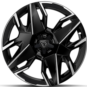
19" 'YARI' Alloy Wheels Black Diamond