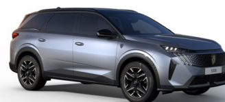
Cumulus Grey metallic $750