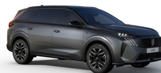
Titane Grey metallic $750