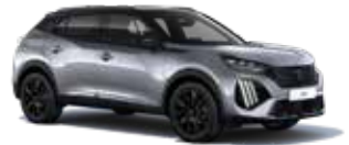
Cumulus Grey (M0F4) metallic $550