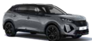
Selenium Grey (MOLD) metallic $950