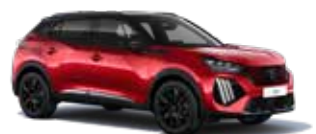
Elixir Red (M5VH) special $950