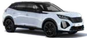
Okenite White (MOSU) metallic $550