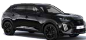
Nera Black (M09V) metallic $550