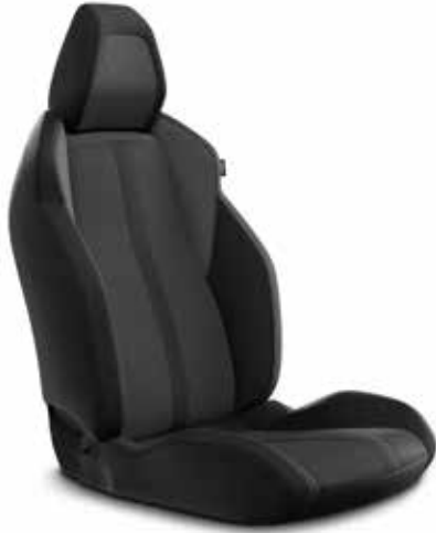
'Belomka' Seat Trim Standard