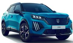
Obsession Blue (MODP) metallic $0